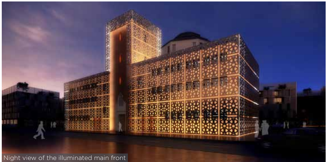
Night view of the illuminated main front