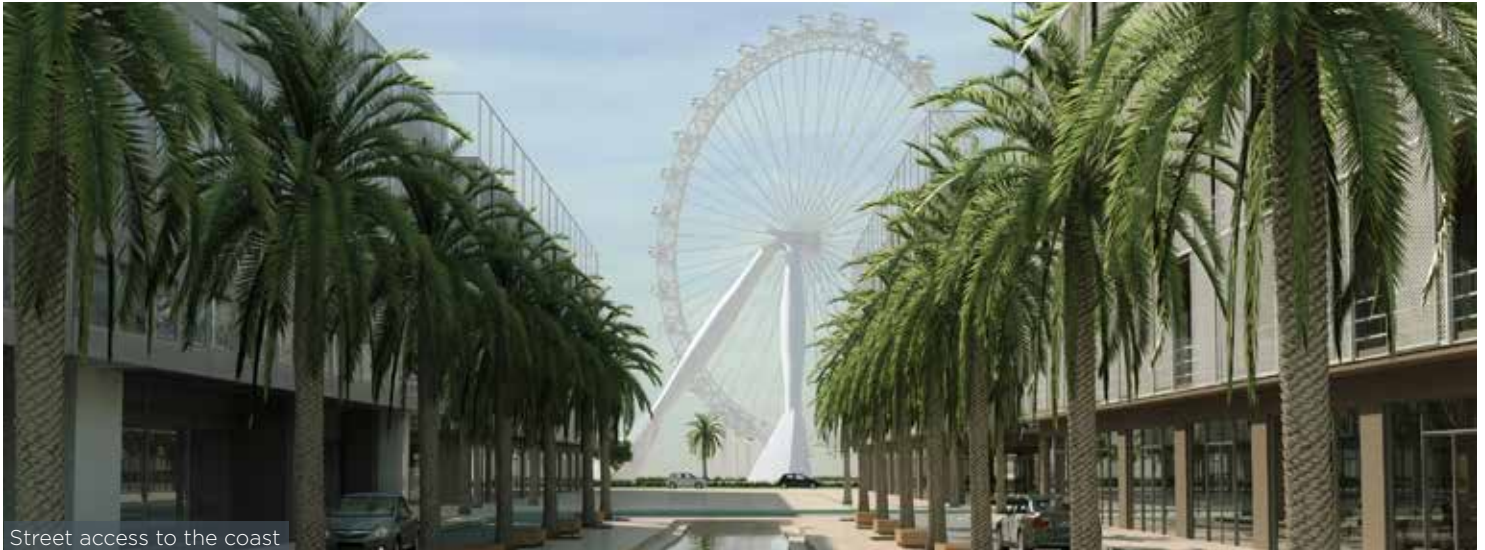
Street access to the coast

Rabat is known as the city of public employees, since all ministries, bureaus and official state corporations are located there, making up a total of 2.5 million inhabitants in the entire province.