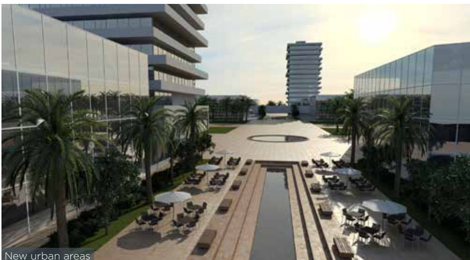
New urban areas

Rabat's master plan proved to be a stimulating challenge, to which only A1V2's experience and multidisciplinary skills were able to provide a successful answer, integrating local cultural and patrimonial references into the latest concepts of urban planning.