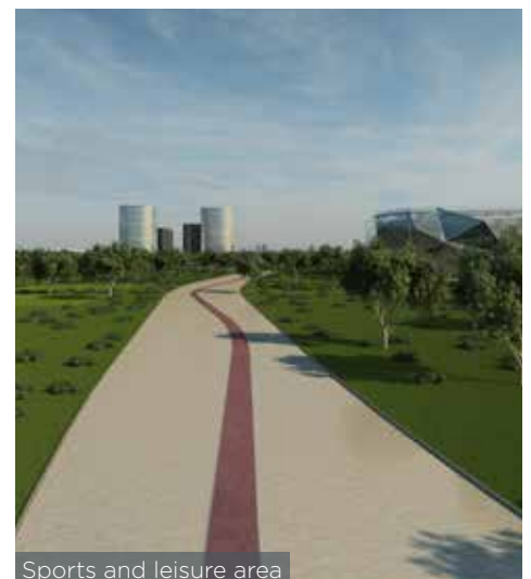
Sports and leisure area