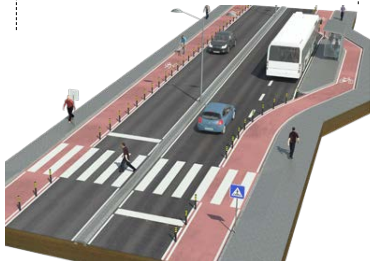
SMART PEDESTRIAN CROSSING WITH LEDS