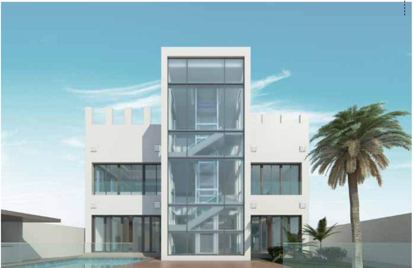
NORTHWEST FACADE WITH ACCESS TO THE BEACH

On the main access side, the area is to be repaved, creating flower beds in articulation with the facade and with the outer boundary of the house. On the beach side, the project includes the creation of a new swimming pool, garden, barbecue and pergola, which soften the relationship between the new facade and the beach and allow the enjoyment of the improved outdoor space.