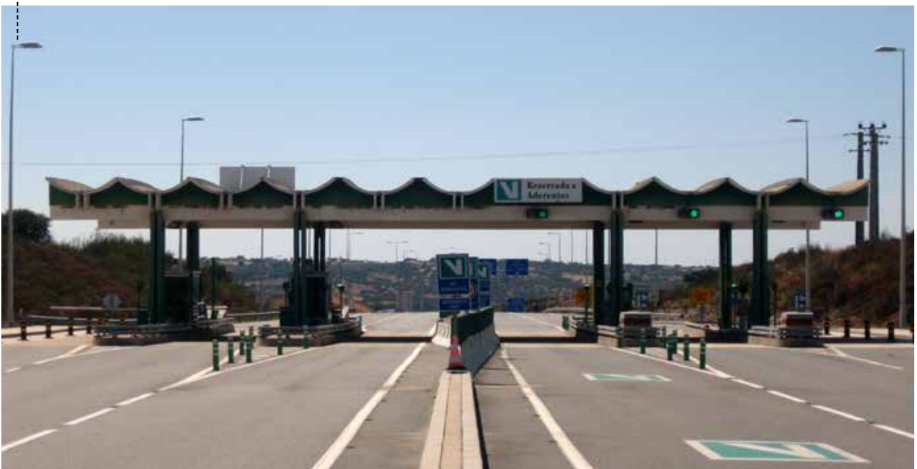
TOLL BOOTH AREA

A1V2 participated in this project in the specialties of drainage, traffic signs and road safety equipment.