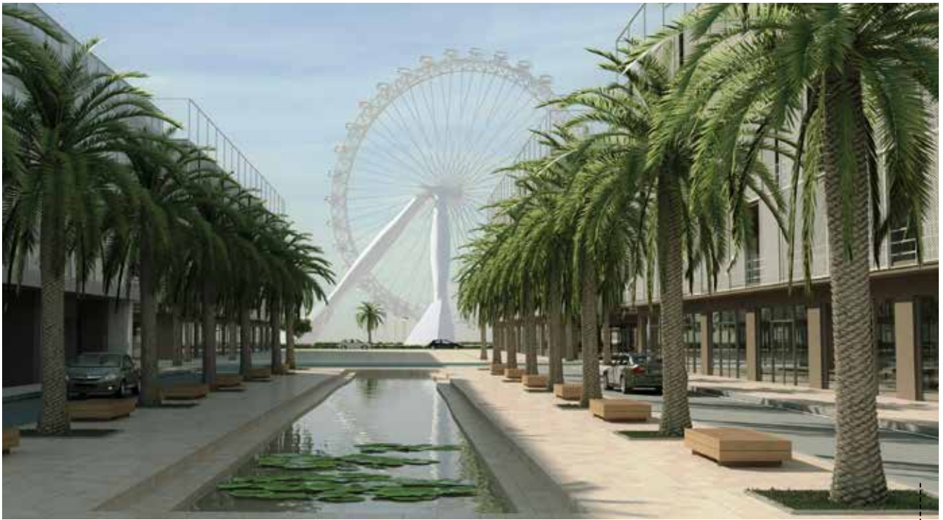
STREET ACCESS TO THE COAST

Based on these numbers and this reality, the new master plan took into account the development of new urban areas with administrative, governmental, financial and residential infrastructures. The project thus brought a renewed vitality to the urban organisation of the Moroccan capital.