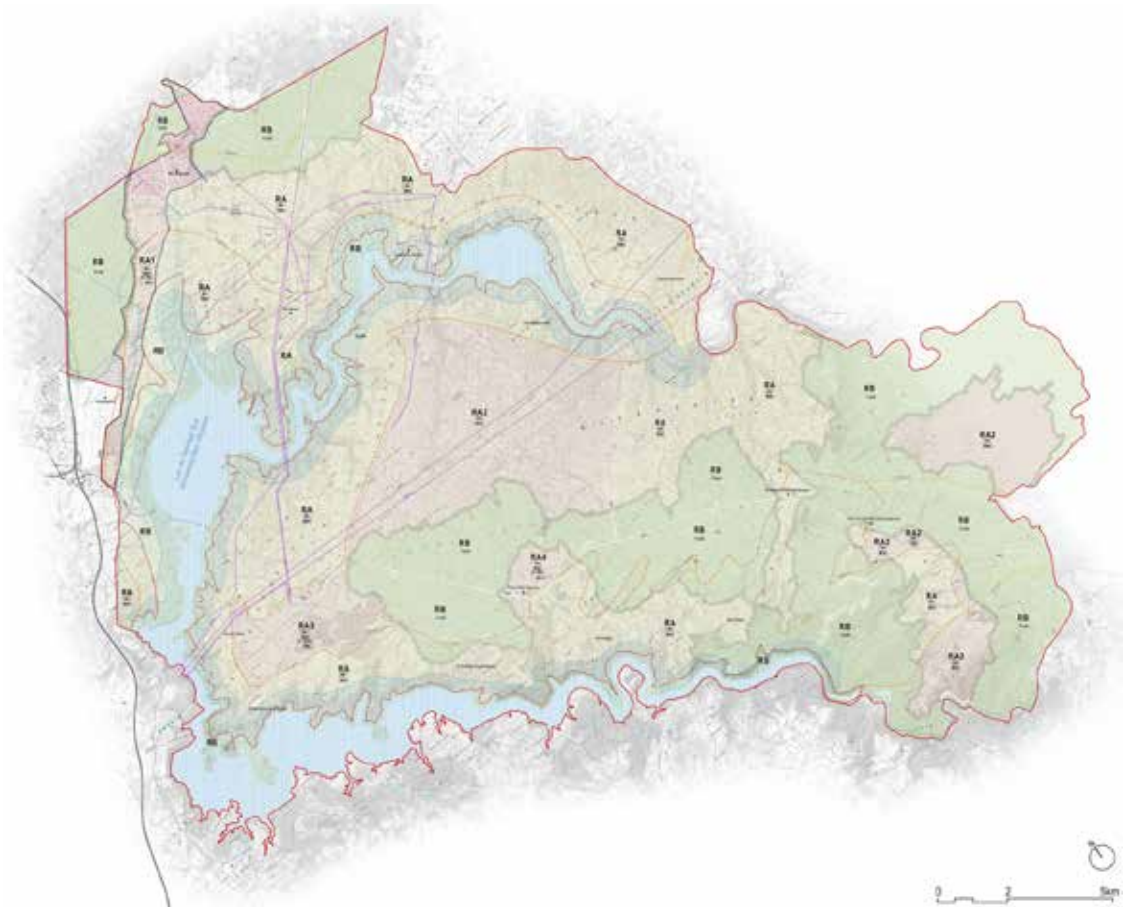
SHOUL RURAL COMMUNE DEVELOPMENT PLAN