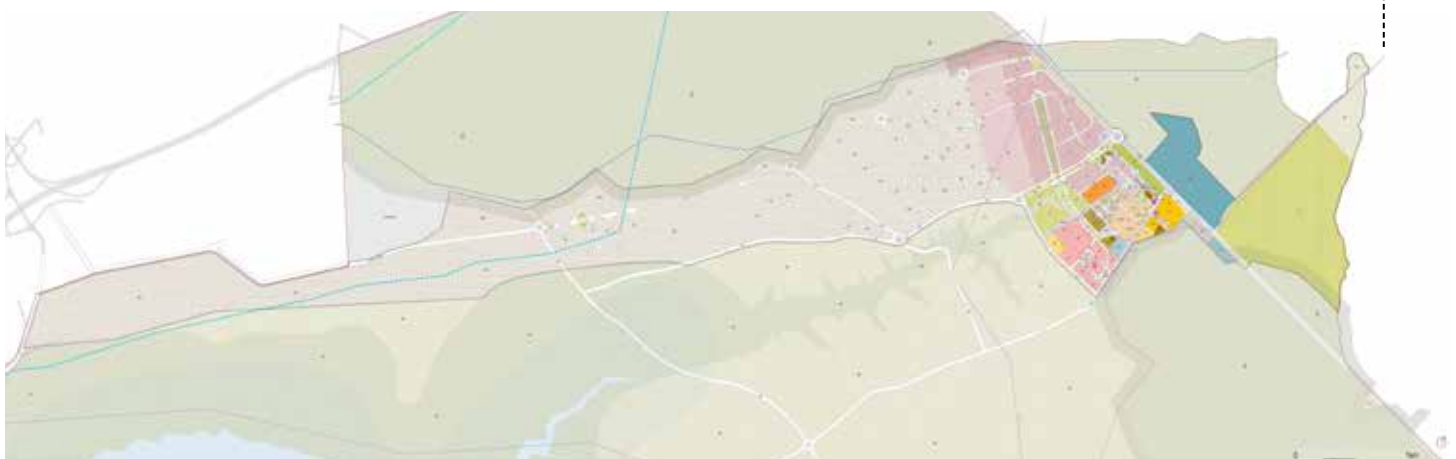
EL ARJATE URBANIZATION PLAN

Works took place from 2011 to 2014, respecting the contracted deadlines and in keeping with customer satisfaction.